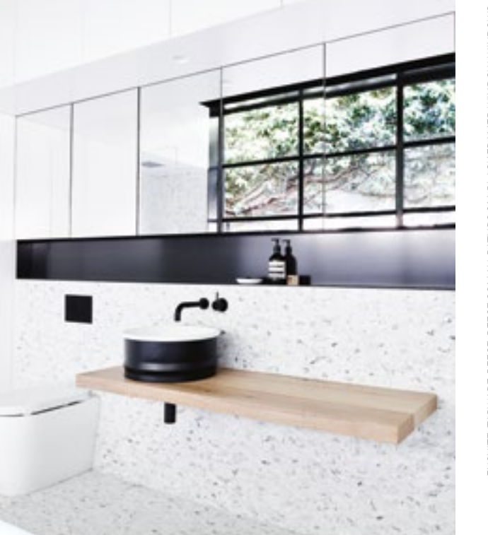
NSUITE: TAPWARE, REECE, REECE COMAU, BATHROOM, BLACKFRAMED WINDOW, WINDOW IN THE WORLD, WINDOWSONTHEWORLD.COMAU, AGAPE BASIN AND BATHTUB, ARTEDOM RTEDOMUSCOM. "EGGCUP" TIMBER STOOL, MARK TUCKEY, MARKTUCKEY.COMAU, CEILINC AINTED IN LUCK, DULUX, DULUX.COMAU, PAINT COLOUR MAY VARY ON APPLICATION

An existing bathroom and laundry were combined into one room, with some clever tricks used to create storage and make it feel spacious. "We like to create storage that's completely concealed so it looks like part of the architecture, rather than a cupboard," says Sally. While the floating timber vanity looks minimal, the mirrored section is made up of recessed cabinets and the bulkhead above is also cabinetry. "We've used joinery almost like an architectural element," says Sally. The laundry is concealed behind doors but it is fully functional, with a washer and dryer, hamper storage, hanging rail, drawers and sink. A steel-framed glass door opens to the outside, with the ceiling painted a dark colour so that it recedes, appearing almost limitless. Get real: Build storage into every room to allow even small rooms to maintain a sense of space. Maximise natural light and deceive the eye into seeing even larger spaces with clever paint tricks. See more of Sally's work at northbourne.co. Go to contourcabinets. com.au for more about the cabinet-makers.